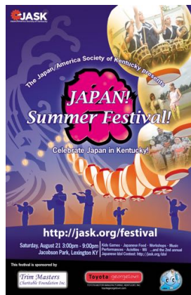
↑ 2010 Poster