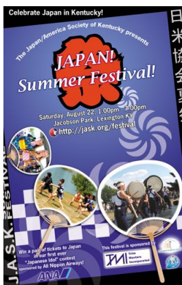
↓ 2009 Poster