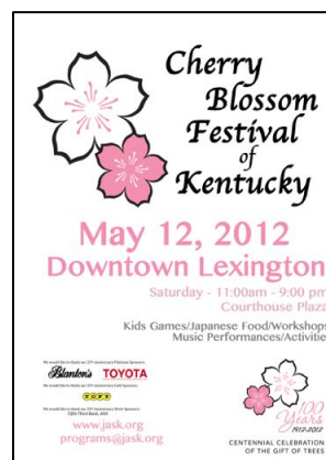
↓ 2012 Poster